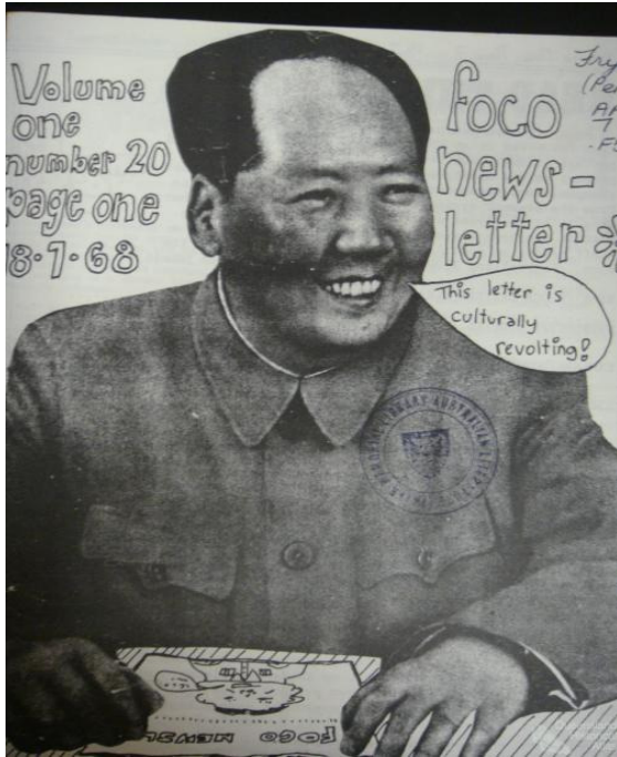
Extract from Foco's newsletter, typifying the irreverent mixture of radical politics and art which characterised the Club ( http://www.qhatlas.com.au/photograph/foco-newsletters-1968 )